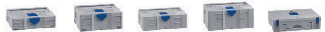
TRUMPF Box S1 TRUMPF Box S2 TRUMPF Box M2 TRUMPF Box M3 TRUMPF Box L2